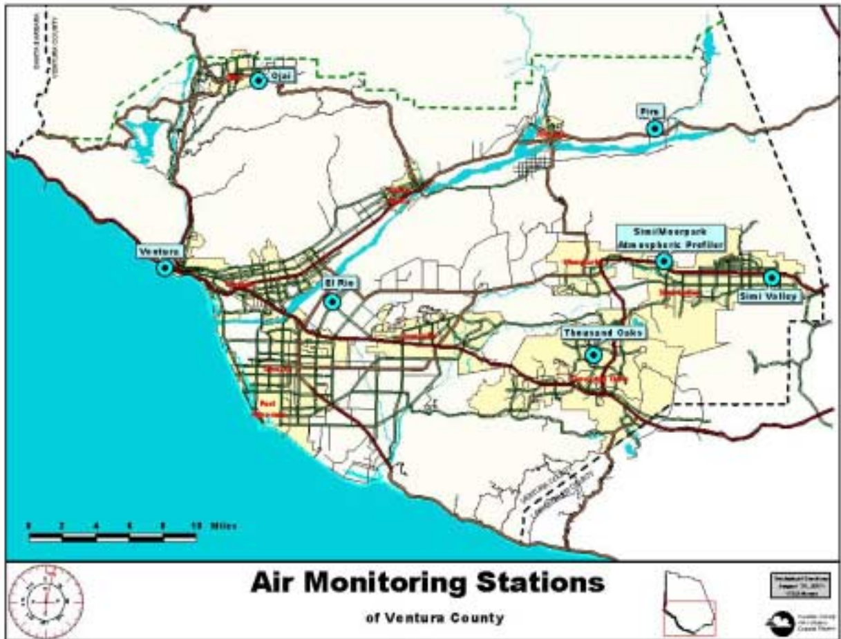
Figure 2 – Ventura County Air Pollution Control District’s Air Monitoring Site Locations

In addition to these local data sources, the meteorologists use a contract meteorological service for satellite images, meteorological charts, and near real-time data. The internet is an invaluable tool for current observation data and a variety of meteorological atmospheric models. Relevant information from all of these sources is reviewed to develop the twice-daily air quality and agricultural burning forecasts.